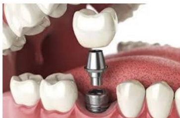
Implant lifespan approximately 25+ years