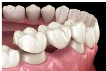
Bridge lifespan approximately 10 years

The longevity of a dental implant is generally very high with an average success rate of 95% after ten years. Dental implants provide a highly predictable solution to replace missing teeth. If you care for your dental implants as you would with natural teeth – by attending regular dental appointments and maintaining a healthy lifestyle – they can last a lifetime.